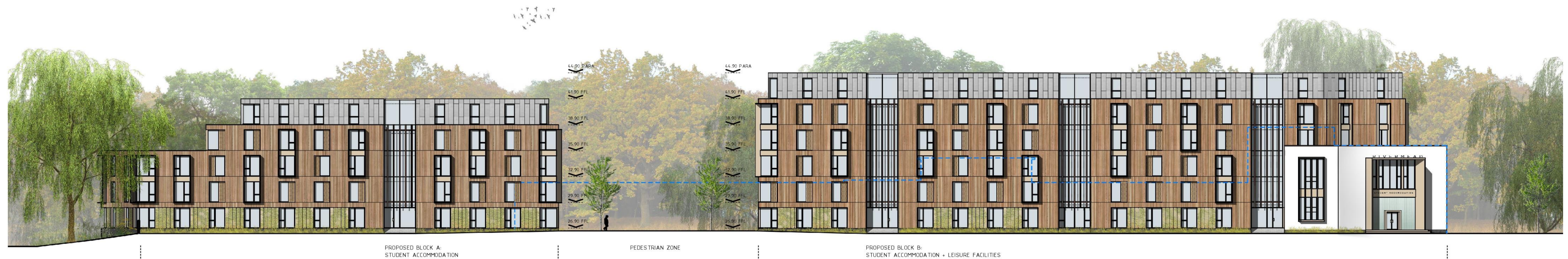
AS PROPOSED: STREET-SCENE (AA)